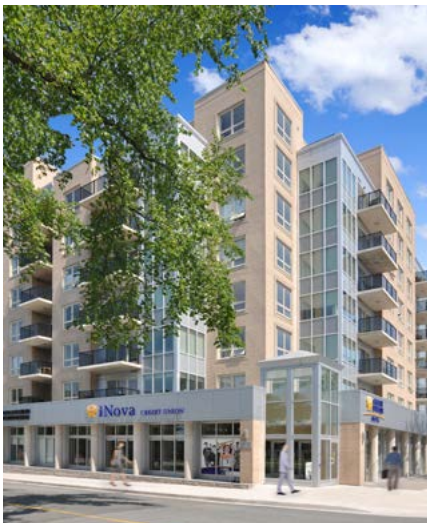
Gladstone North 2761 Gladstone Street

Say hello to Gladstone North – it's new, it's spacious, and it's about as central as you can get on the desirable Halifax peninsula. With banking services, a professional centre, and a new pharmacy on-site, and a 24hr grocery store and medical centre just a walk down Gladstone Street, it's easy to see why Gladstone North has quickly become such a popular place to call home.