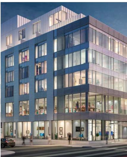
1488 Birmingham 1488 Birmingham Street

Your new residence at 1488 Birmingham Street at Spring Garden Road is at the centre of the most desirable and vibrant downtown locations in all of peninsular Halifax. A prime downtown location deserves nothing but the best of amenities. At 1488 Birmingham, you'll appreciate the extra touches, including: only four residence units per floor, 24/7 property management team, convenient on-site secured bicycle storage, a full service Bank, retail, and a yoga studio.